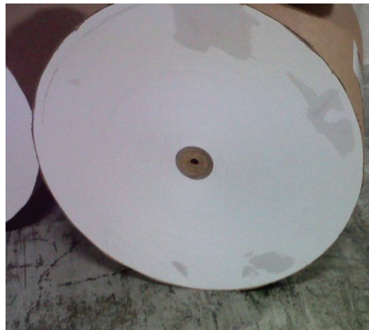
Damaged roll – White Paper