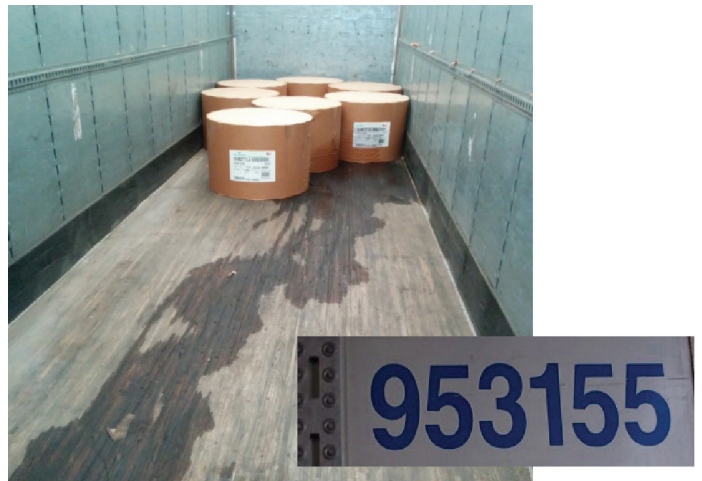
Rolls in the trailer or railcar – notice the wet floor. Include the trailer/railcar ID