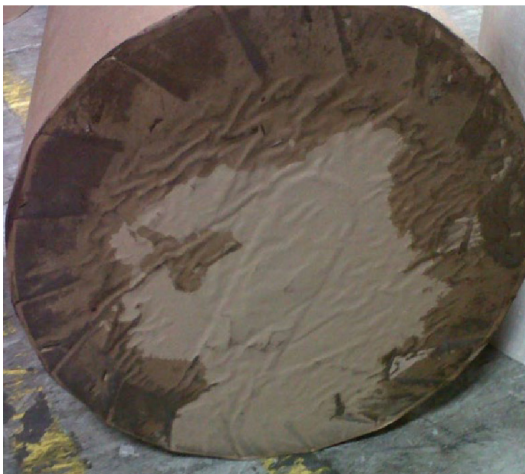
Damaged roll – Header